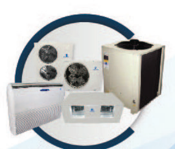
Mini / Ducted Split Units