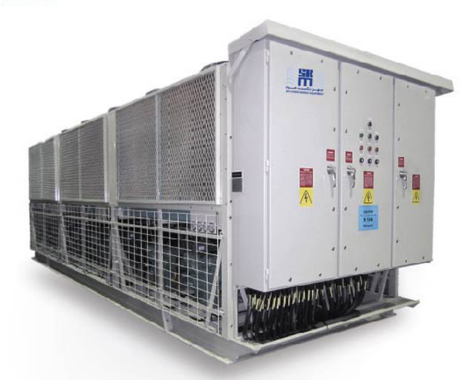
SKM Explosion Proof Chiller

In Oil and Gas projects we work to understand every end-users and client's unique requirements and deliver results by focusing on practical engineering solutions. We align our objectives with our clients' objectives so everyone understands that we are in this process together.