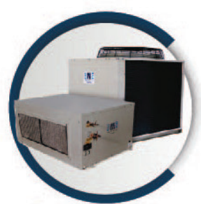
Ducted Split Units