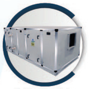
Air Handling Units